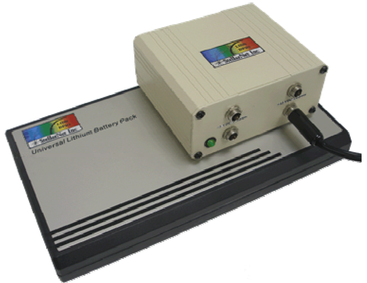
BP2 Battery Pack, (2) +5VDC & (2) +12VDC