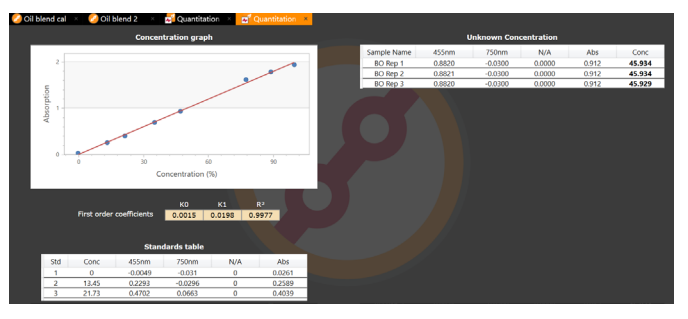
Figure 4 Visacle spectrophotometer software showing the EVOO/SO calibration curve.

A mixture with 14% EVOO was prepared and measured at 455 nm, with the calibration curve affording a result of 12% EVOO. While this result may be acceptable, when a commercial blend (sample BO) of 90% extra virgin olive oil and 10% refined sunflower oil was measured, the curve predicted a concentration of 45% extra virgin olive oil. This suggests that the oils in BO possess significantly different absorption spectra from those in the calibration set, which could be due to a different level of refinement. The result highlights that, for the quantitation to be meaningful, the analyst must calibrate using the same oils that are present in the blend.