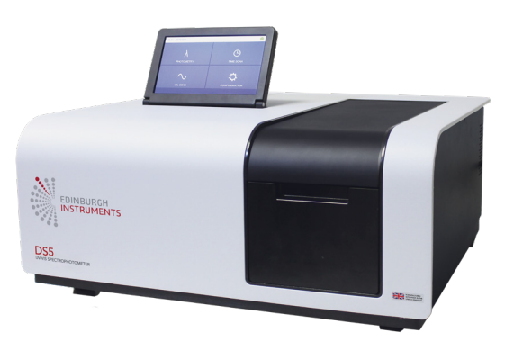
Figure 2 Edinburgh Instruments DS5 UV-Vis Spectrophotometer.

The quality of samples EVOO, VOO, PO, and HEVOO was assessed using the method established by the International Olive Council.<sup>2</sup> The method requires a spectrophotometer which can measure with 1 nm resolution between 220 nm and 360 nm. Linearity, wavelength and photometric accuracy in the UV range must be verified before the measurements. This study employed a DS5 Spectrophotometer (Figure 2). Its performance was validated using holmium oxide and potassium dichromate standards. The samples were diluted in isooctane to a concentration of 1% (m/V), transferred to quartz cuvettes and studied in the DS5 Spectrophotometer after performing a baseline correction.