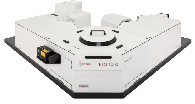
FLS1000 Photoluminescence Spectrometer

Persistent luminescence, commonly called afterglow, is characterised by long-lasting visible emission over several hours after ultraviolet excitation. This finds wide applications in glow-in-the-dark signage and in-vivo imaging for disease diagnosis and treatment. However, biological tissue allows transmission of near-infrared (NIR) light shorter than 1400 nm due to absorption by water and lipids.<sup>1</sup> The majority of bio-imaging applications utilises the 700 nm-950 nm window.<sup>2-4</sup>