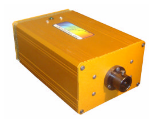
Worlds smallest long life & high power deuterium light source for CW (continuous wave) UltraViolet for the 190-450nm