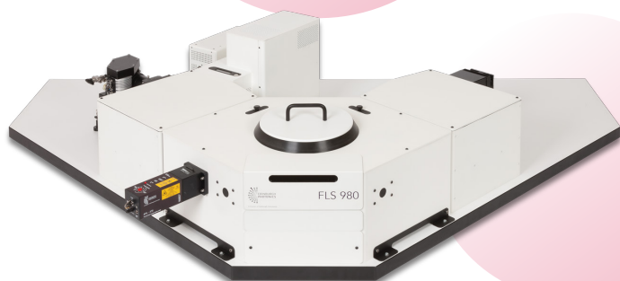
FLS980 Photoluminescence Spectrometer

Phosphors used in discharge lamps and light emitting diodes 1 , displays 2 and scintillators 3,4 are commonly characterised via photoluminescence spectroscopy. Their light emitting properties are connected to the structure and the interaction of the active ions with the lattice. Moreover, vibrations in the lattice are sensitive to environmental temperature changes.